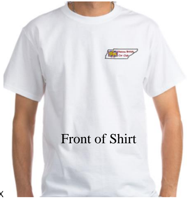
Front of Shirt